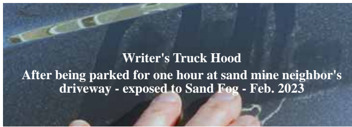
Writer's Truck Hood After being parked for one hour at sand mine neighbor's driveway - exposed to Sand Fog - Feb. 2023

A review of the town's website shows the committee met seven times in 2022: Jan. 26, April 27, July 27, Sept. 7, Oct. 5, Nov. 9, and Dec. 7. Seven neighbors were asked about the timing of meetings and each replied similarly: They never know unless someone says something, because notice is not given, meetings pop-up somehow, and often they are cancelled. The online calendar noted six meetings "cancelled" on the 2022 calendar. ♦